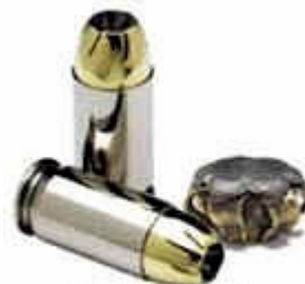
.45 ACP BJHP (+P) 185-gr.